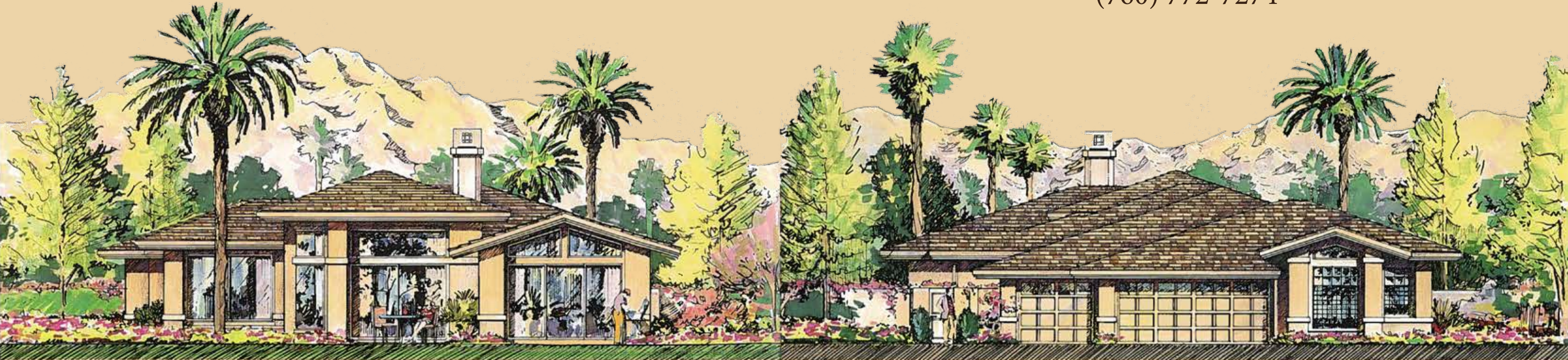
REAR "B" ELEVATION