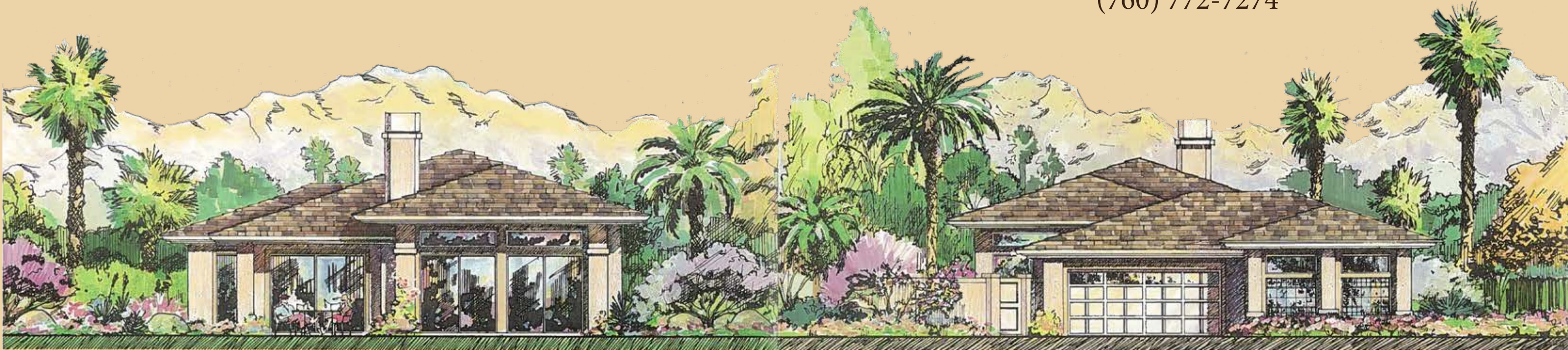
REAR "A" ELEVATION

Indian Ridge ON-SITE SALES (760) 772-7274