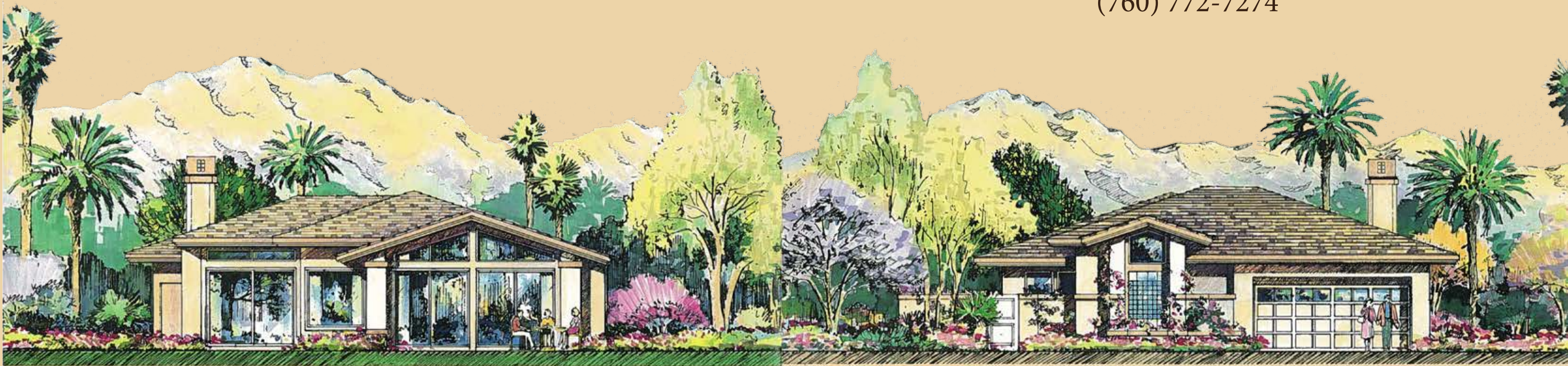
REAR "B" ELEVATION

Indian Ridge ON-SITE SALES (760) 772-7274