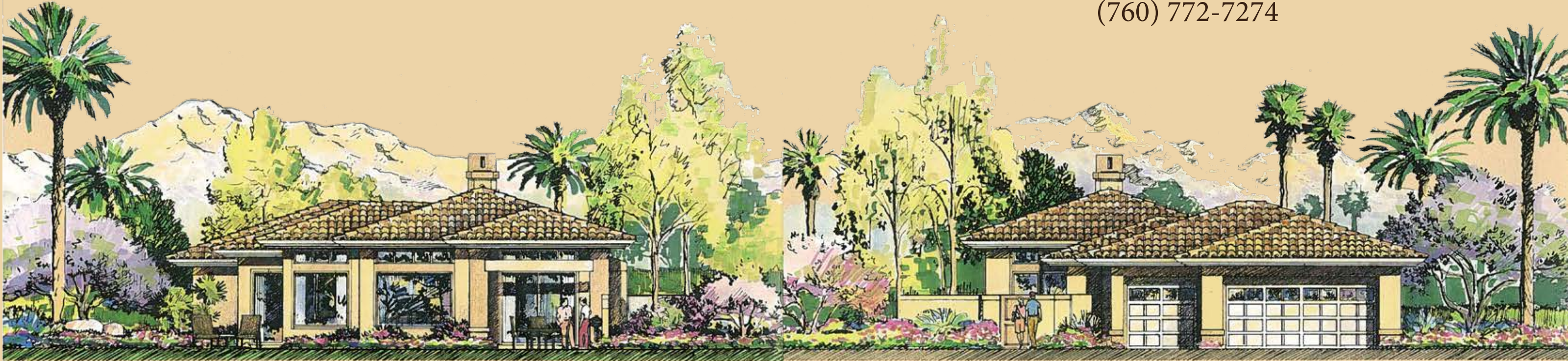
REAR "A" ELEVATION

Indian Ridge ON-SITE SALES (760) 772-7274