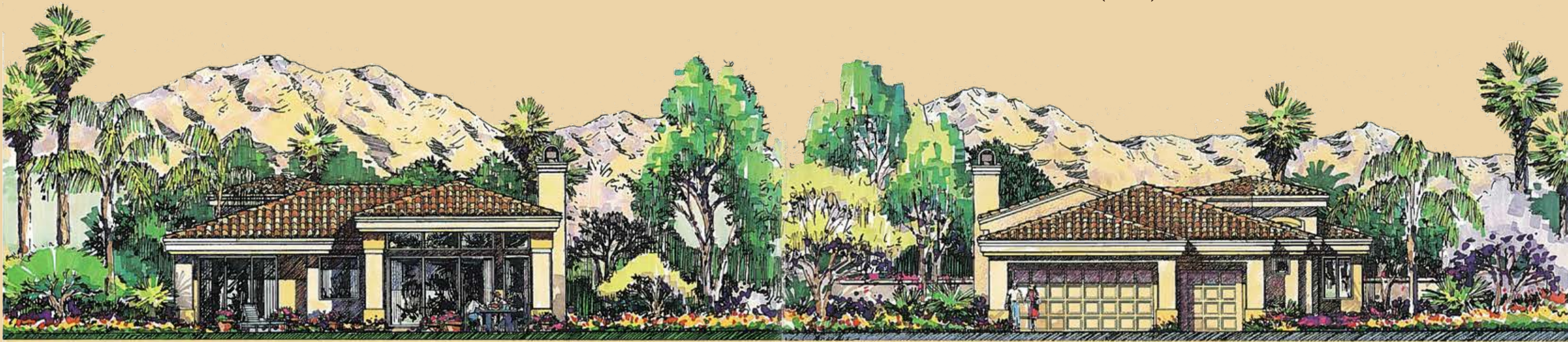
REAR "A" ELEVATION

Indian Ridge ON-SITE SALES (760) 772-7274