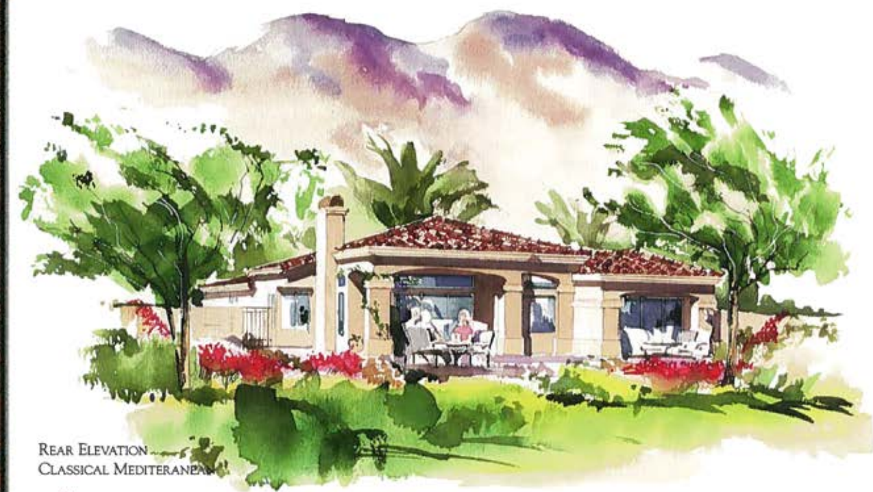
REAR ELEVATION CLASSICAL MEDITERANEAN