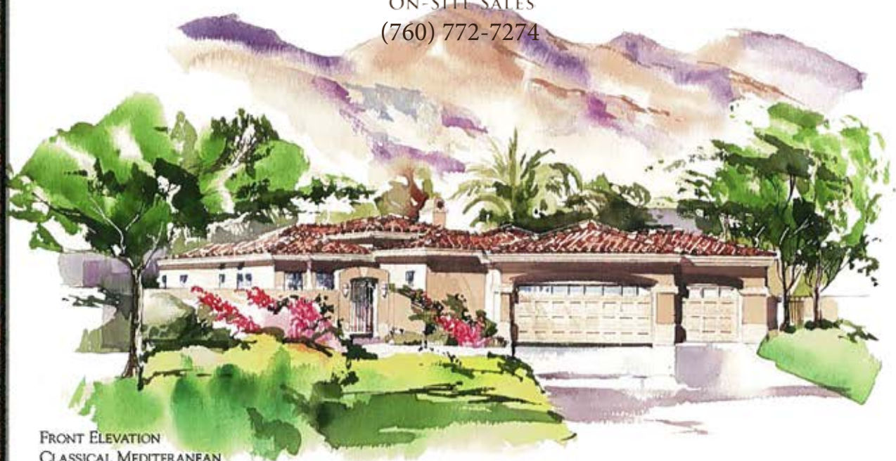
FRONT ELEVATION CLASSICAL MEDITERANEAN