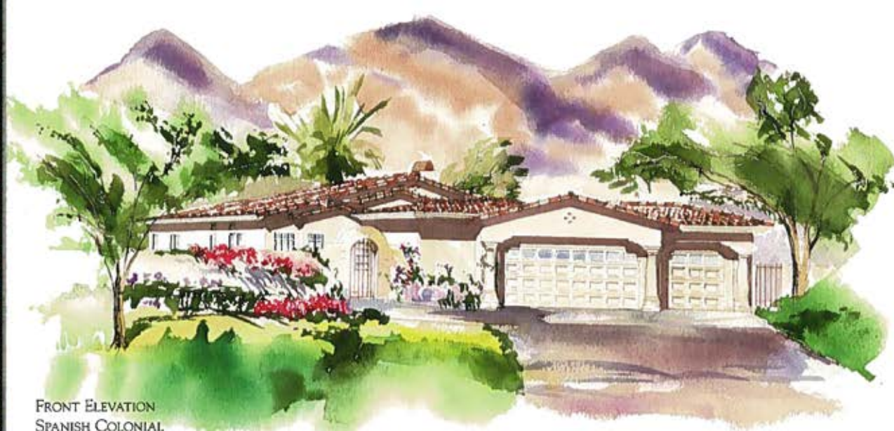
FRONT ELEVATION SPANISH COLONIAL