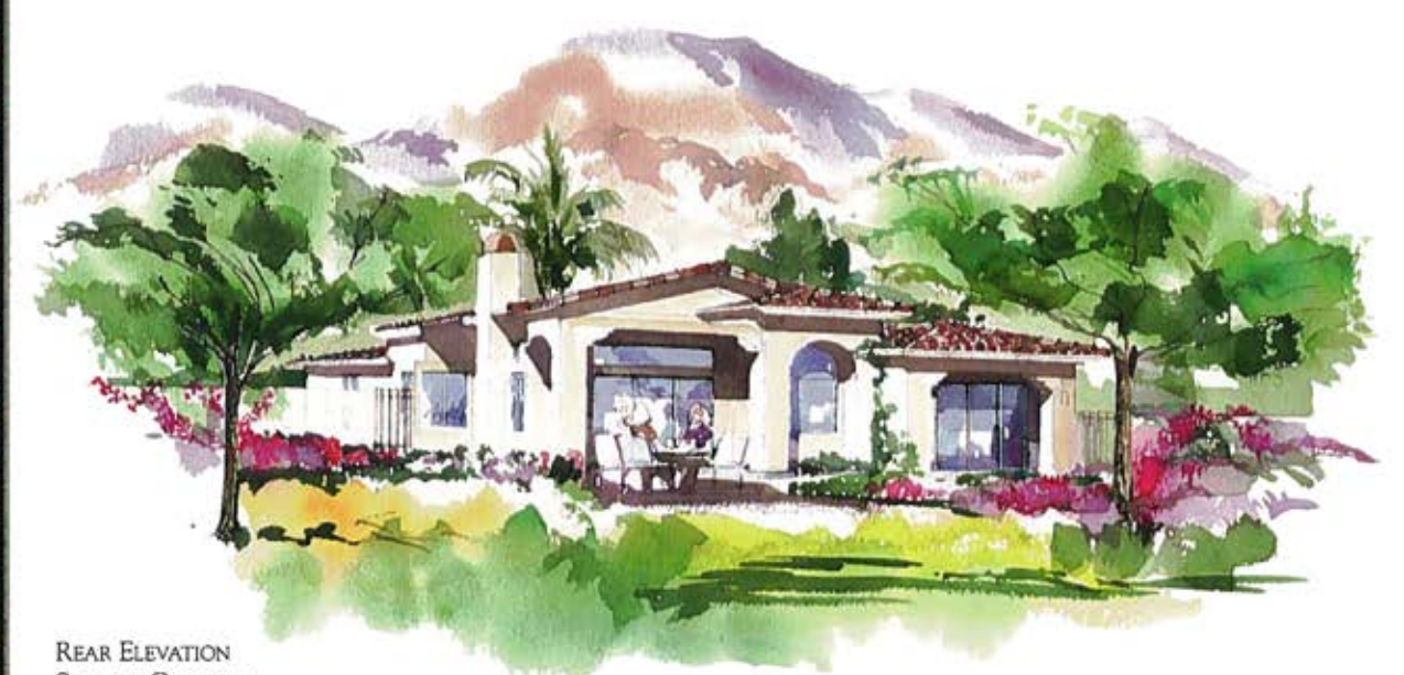
REAR ELEVATION SPANISH COLONIAL