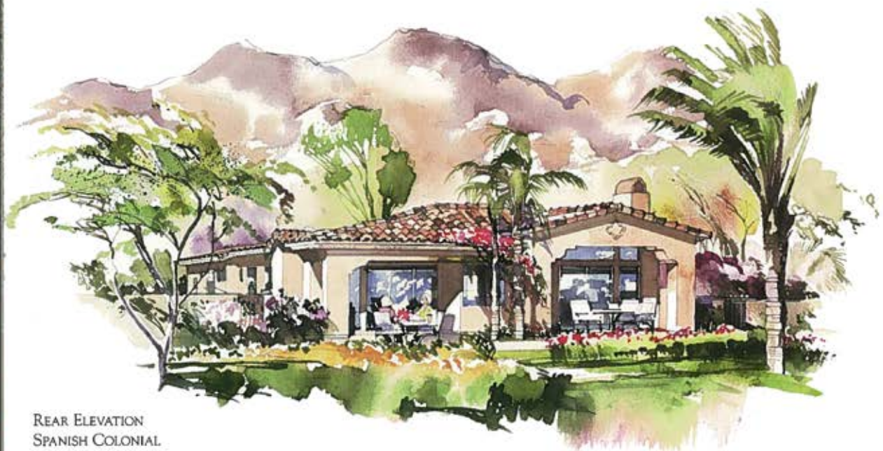
REAR ELEVATION SPANISH COLONIAL