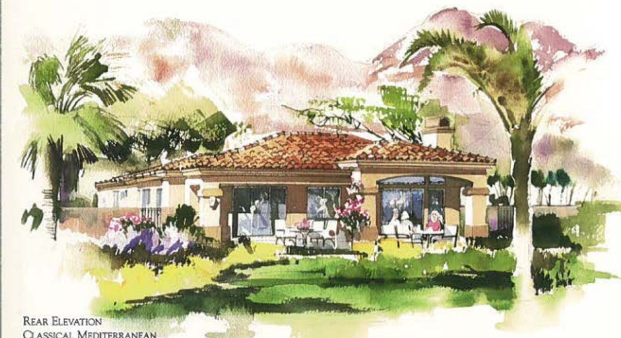
REAR ELEVATION CLASSICAL MEDITERRANEAN