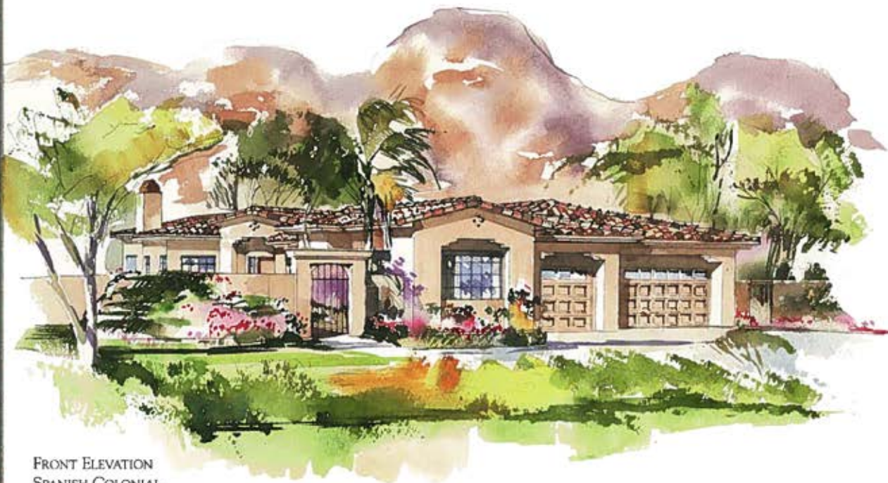
FRONT ELEVATION SPANISH COLONIAL