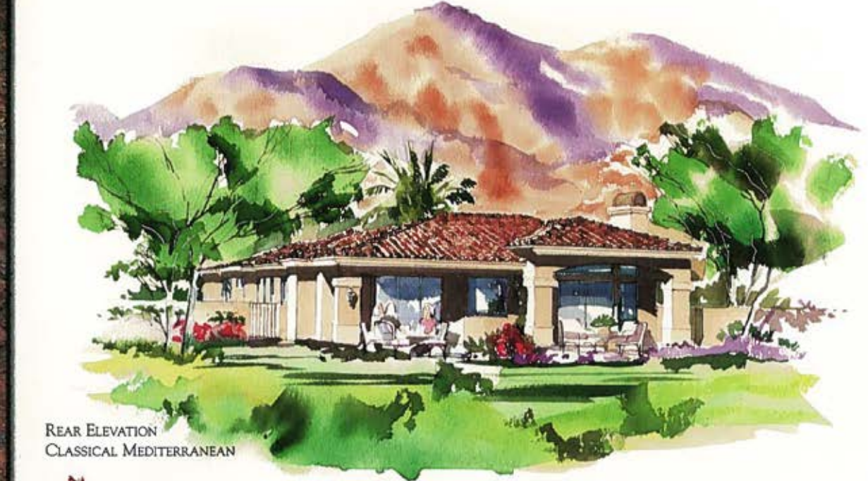
REAR ELEVATION CLASSICAL MEDITERRANEAN