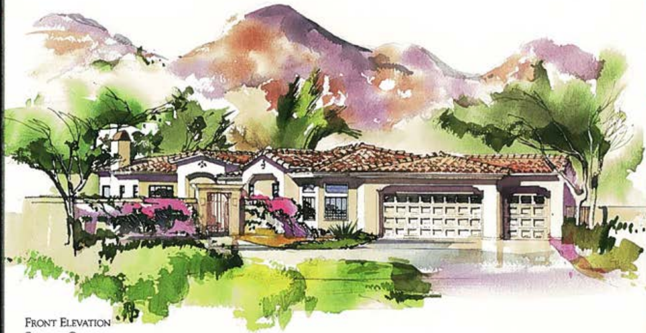
FRONT ELEVATION SPANISH COLONIAL