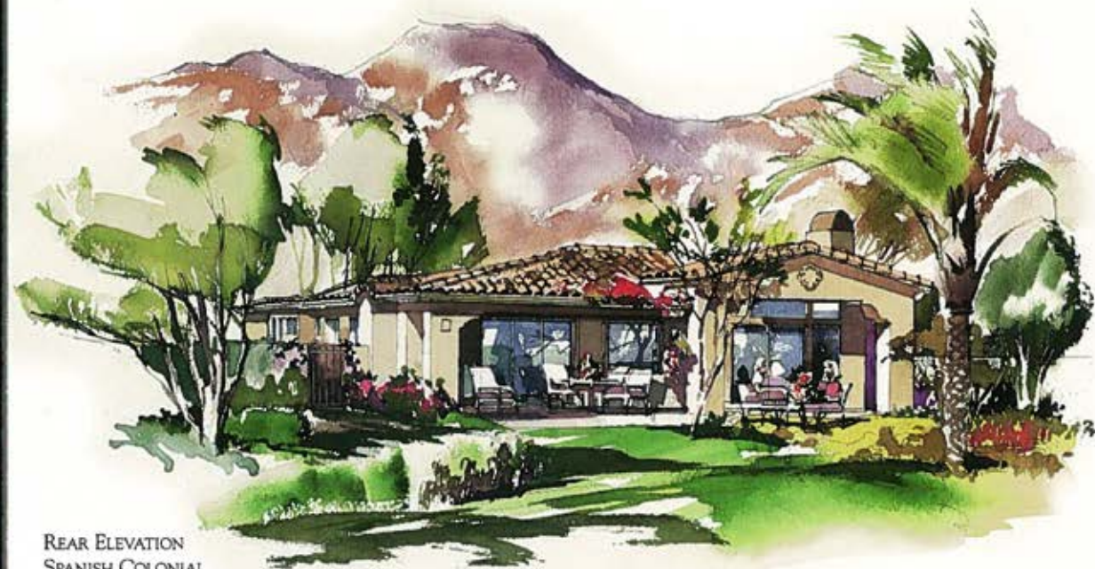
REAR ELEVATION SPANISH COLONIAL