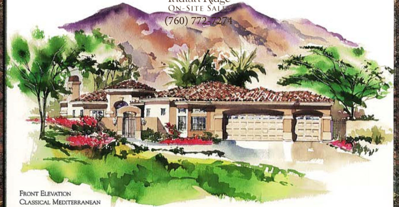
FRONT ELEVATION CLASSICAL MEDITERRANEAN

Indian Ridge ON-SITE SALES (760) 772-7274