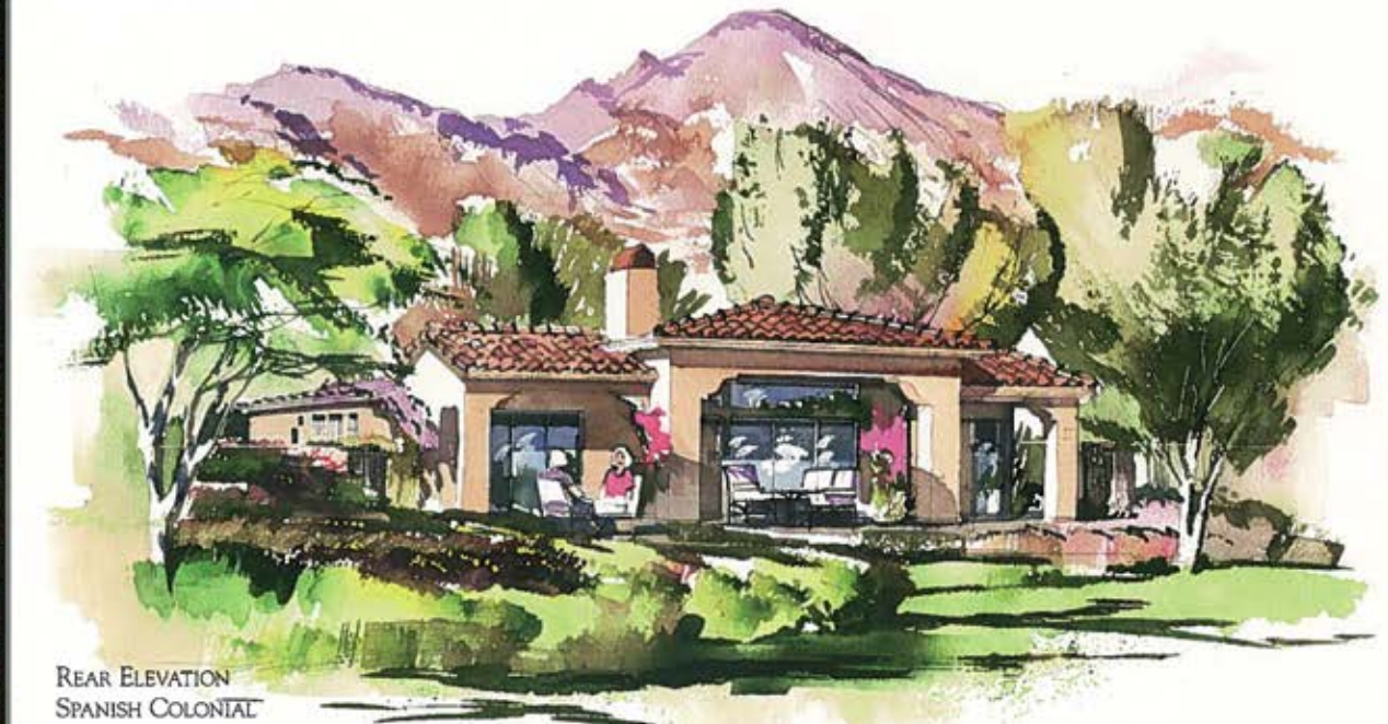
REAR ELEVATION SPANISH COLONIAL