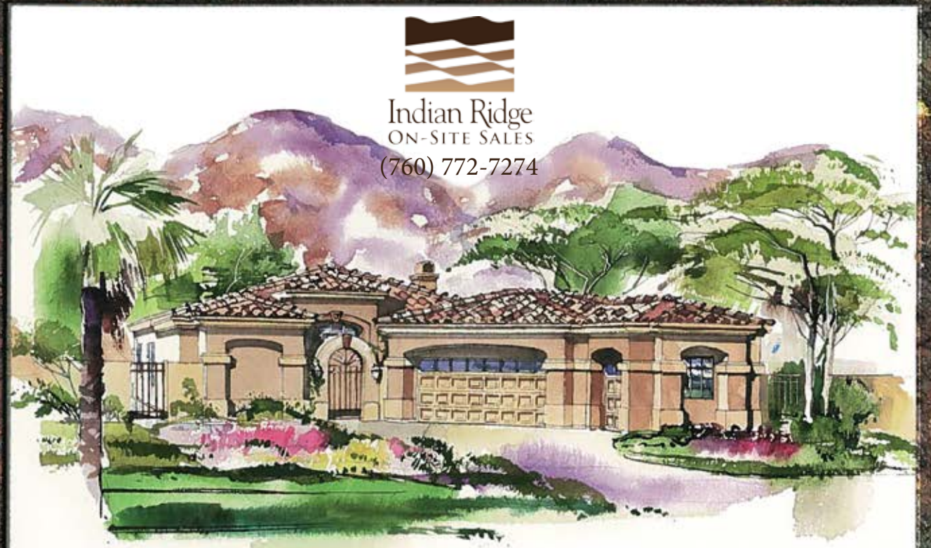
FRONT ELEVATION CLASSICAL MEDITERRANEAN

(760) 772-7274 Info@IndianRidgeOn-SiteSales.com www.IndianRidgeOn-SiteSales.com