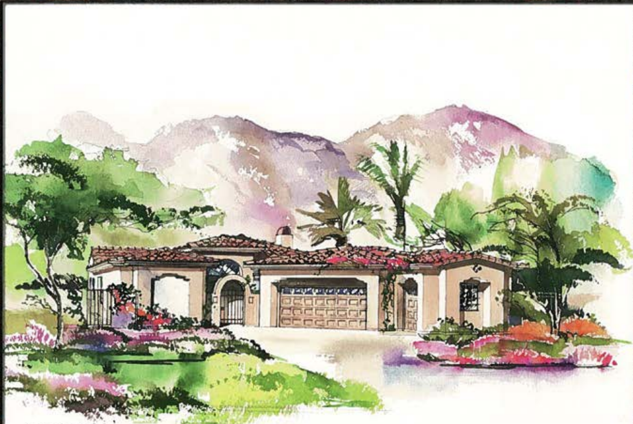
FRONT ELEVATION SPANISH COLONIAL