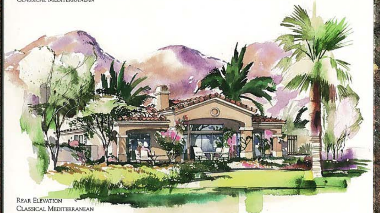
REAR ELEVATION CLASSICAL MEDITERRANEAN