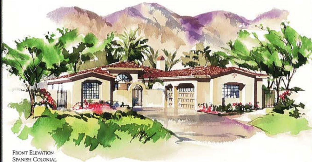
FRONT ELEVATION SPANISH COLONIAL