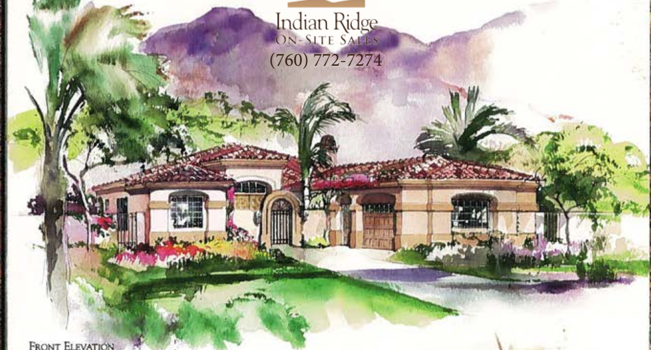
FRONT ELEVATION CLASSICAL MEDITERRANEAN

Indian Ridge ON-SITE SALES (760) 772-7274