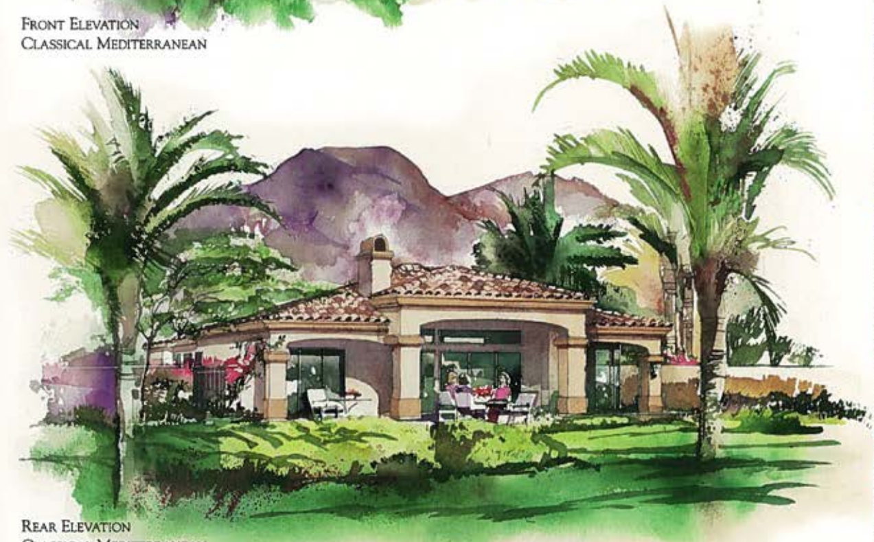
REAR ELEVATION CLASSICAL MEDITERRANEAN