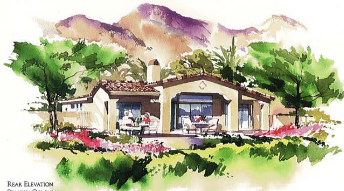
REAR ELEVATION SPANISH COLONIAL