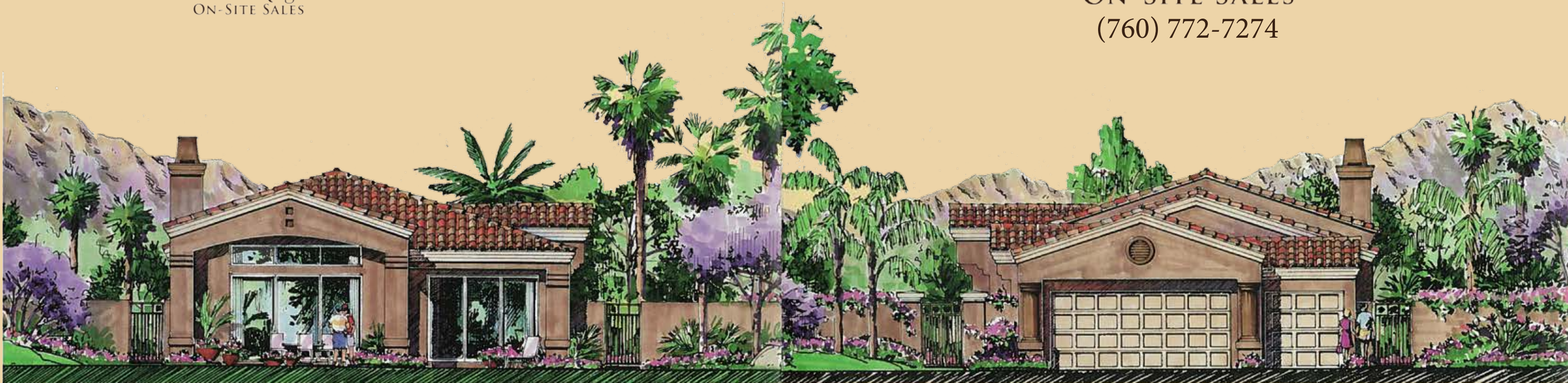
REAR "B" ELEVATION

Indian Ridge ON-SITE SALES (760) 772-7274