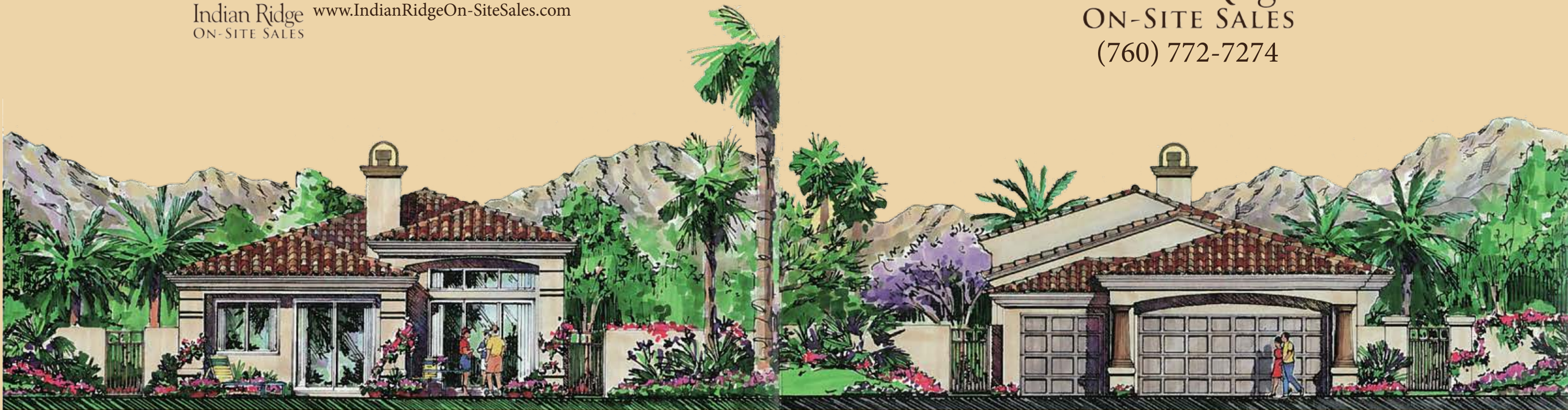
REAR "A" ELEVATION

Indian Ridge ON-SITE SALES (760) 772-7274