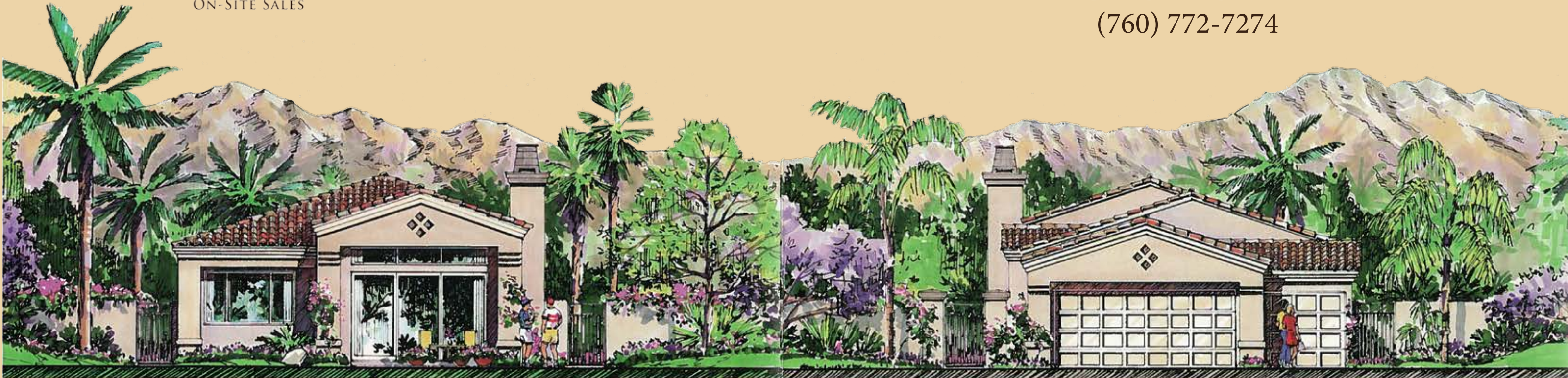
REAR "B" ELEVATION

Indian Ridge ON-SITE SALES (760) 772-7274