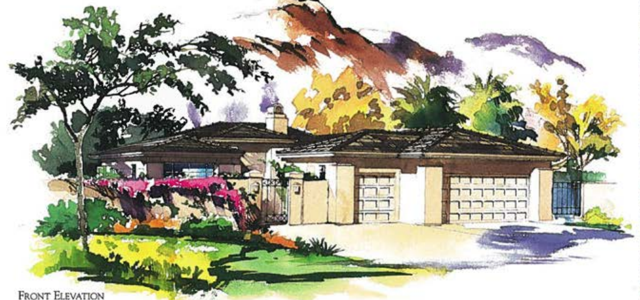
FRONT ELEVATION CALIFORNIA CONTEMPORARY

Indian Ridge ON-SITE SALES (760) 772-7274