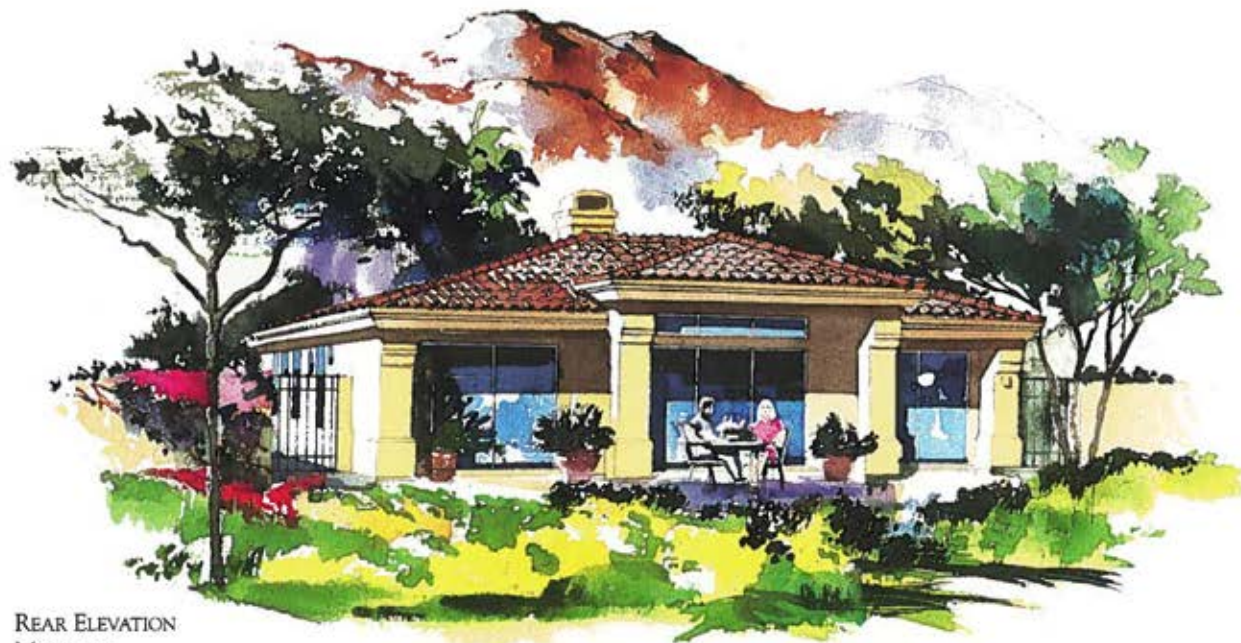
REAR ELEVATION MONTEREY