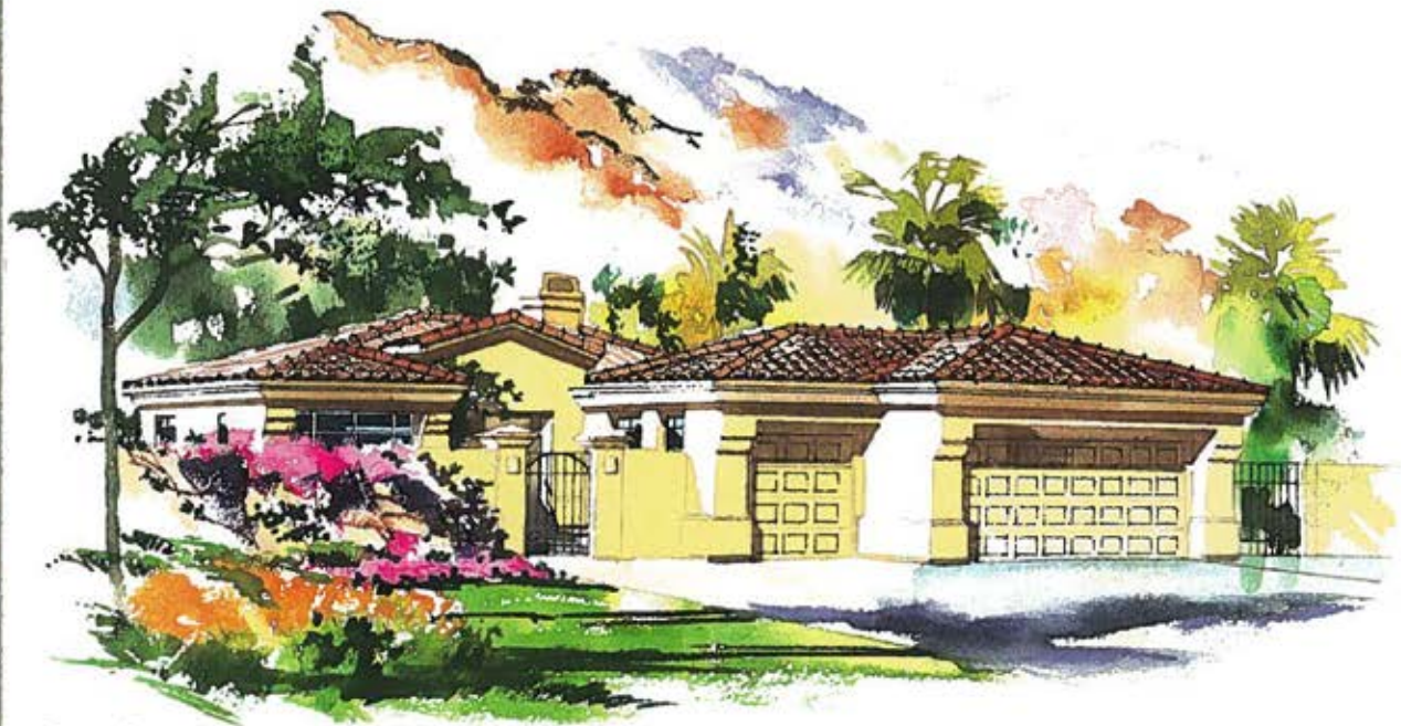
FRONT ELEVATION MONTEREY