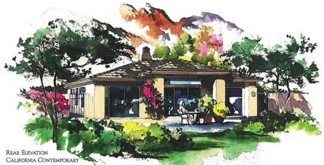
REAR ELEVATION CALIFORNIA CONTEMPORARY