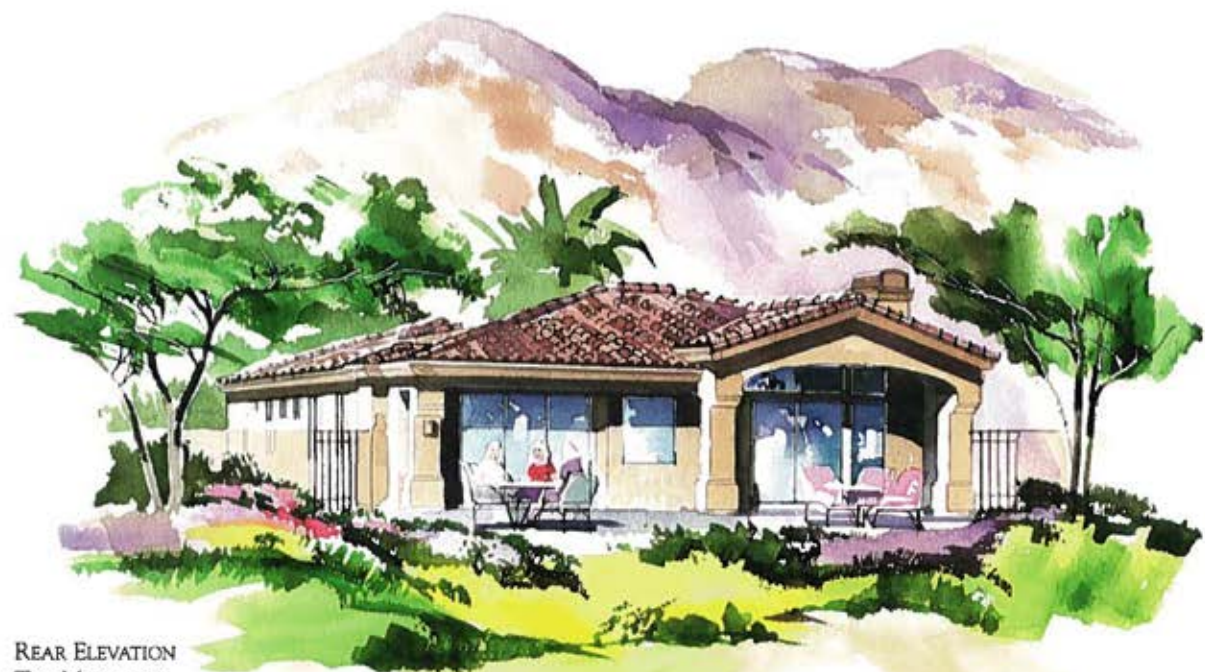
REAR ELEVATION THE MONTEREY