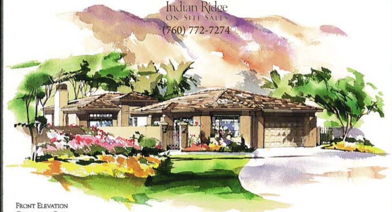
FRONT ELEVATION CALIFORNIA CONTEMPORARY

Indian Ridge ON-SITE SALES (760) 772-7274