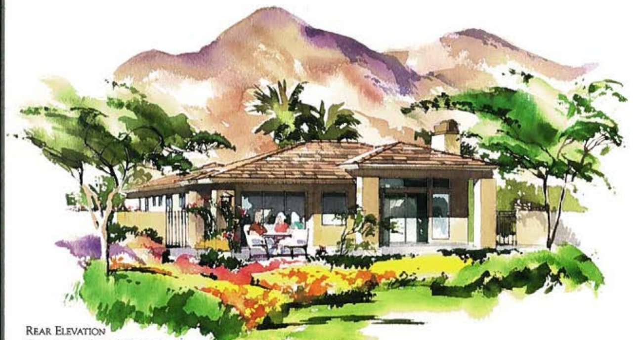
REAR ELEVATION CALIFORNIA CONTEMPORARY