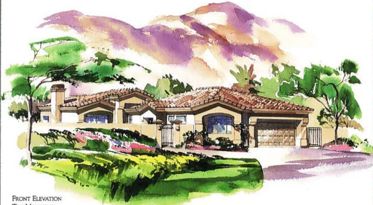
FRONT ELEVATION THE MONTEREY