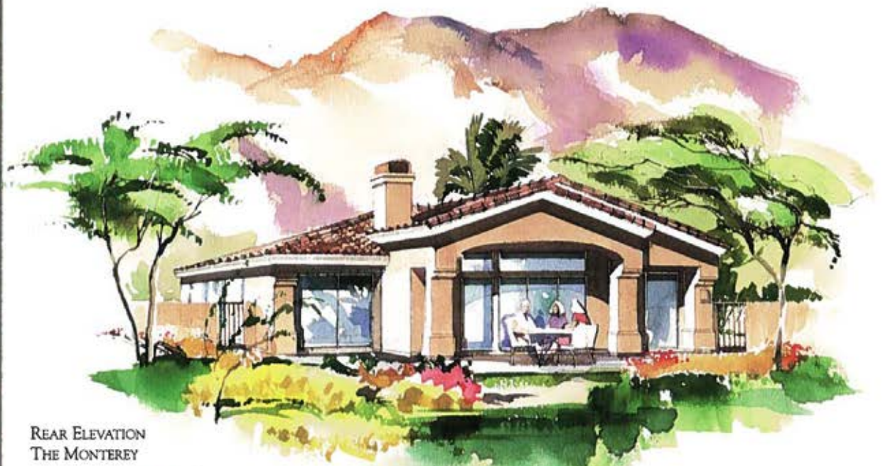
REAR ELEVATION THE MONTEREY