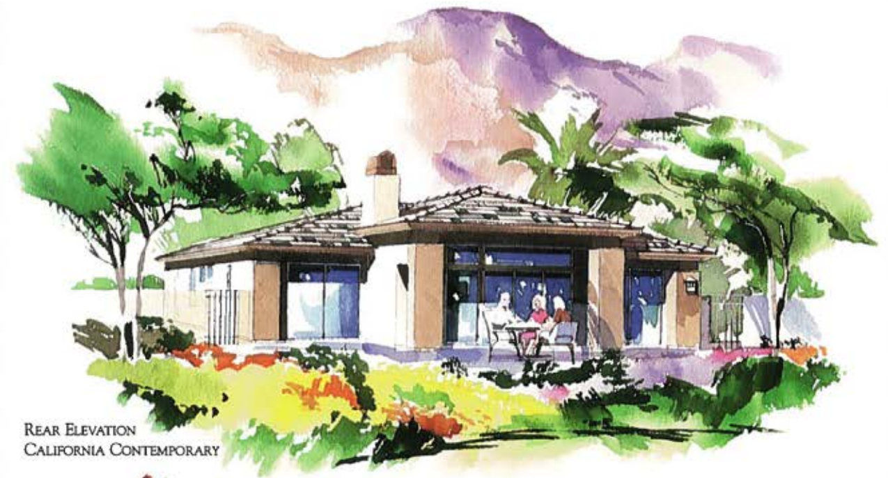
REAR ELEVATION CALIFORNIA CONTEMPORARY