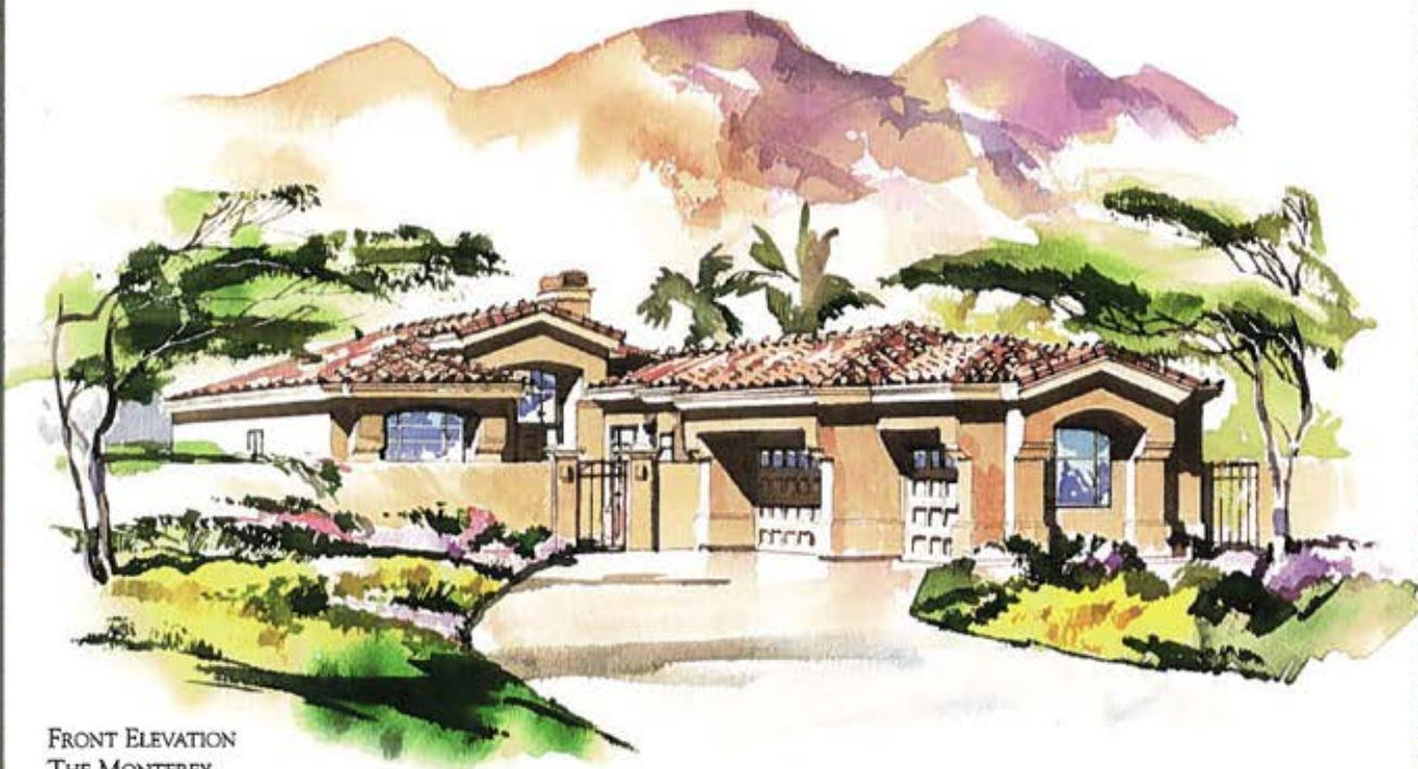
FRONT ELEVATION THE MONTEREY