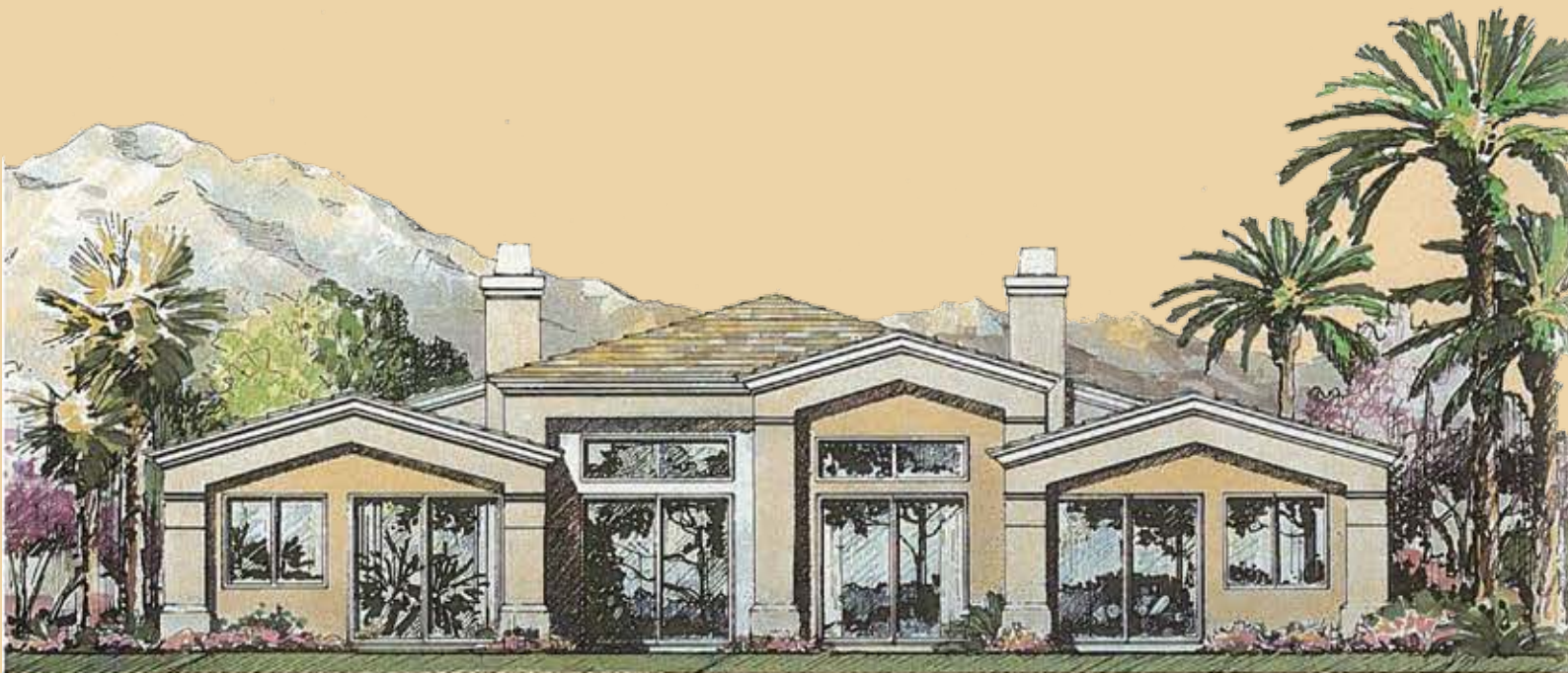
REAR "B" ELEVATION

Indian Ridge ON-SITE SALES (760) 772-7274