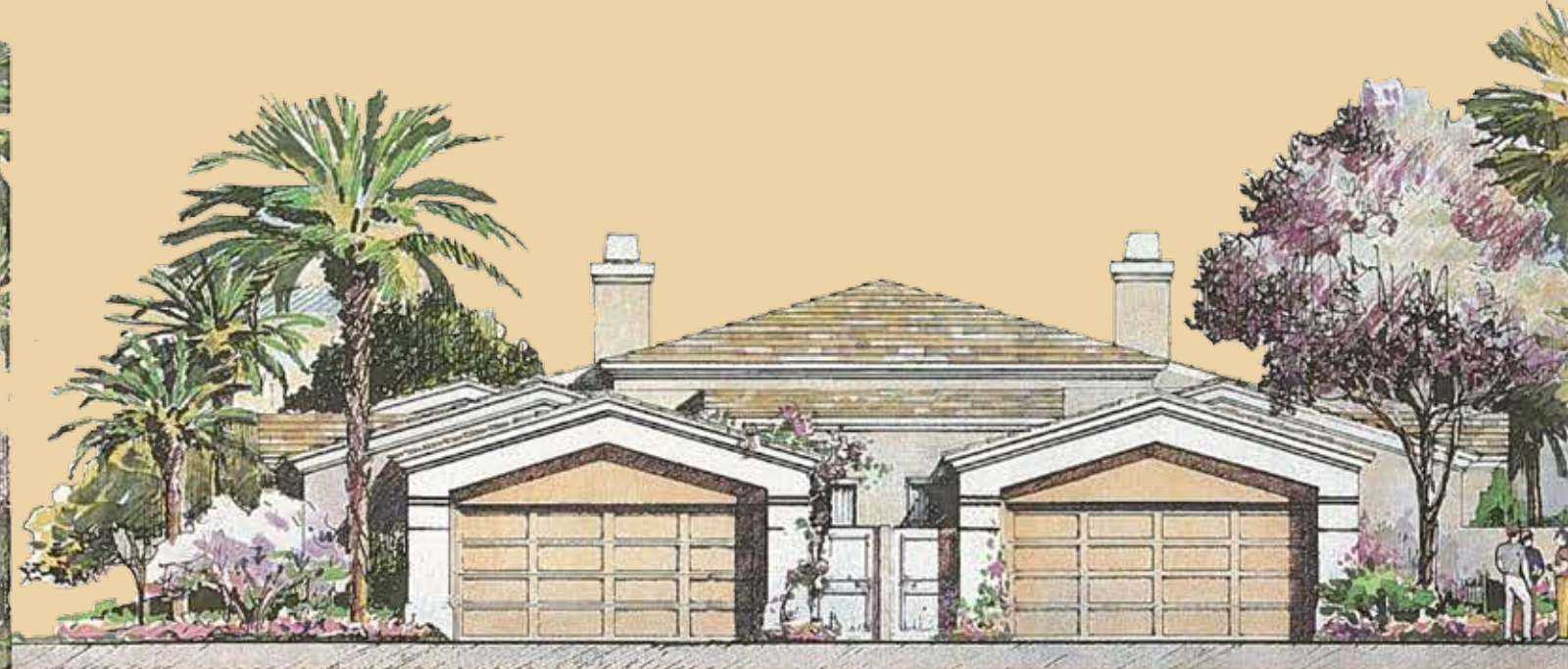
FRONT "B" ELEVATION

The total number, design, location and layout of homes, landscaping, sideyard walls, lakes, pools and spas, unit mix, and the location, design and layout of recreational facilities may be changed due to a number of circumstances, including governmental requirements and market demand. Sunrise Company also reserves the right to make modifications in prices, materials and specifications at any time without prior notice. Ownership of a home does not include club membership or rights in the club facilities. Club membership is subject to approval of the membership committee and to payment of initiation fee and dues. Void where prohibited by law.