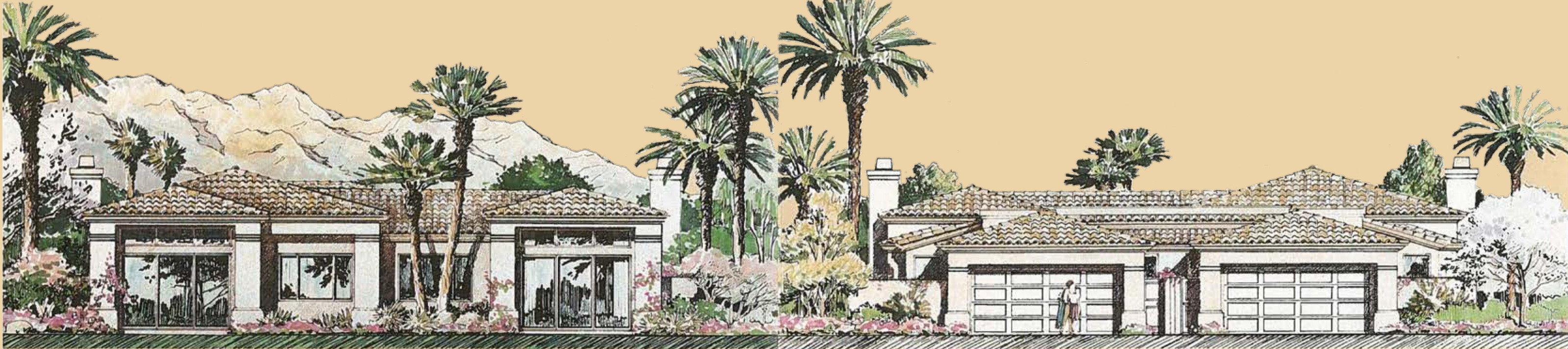
REAR "A" ELEVATION

Indian Ridge ON-SITE SALES (760) 772-7274