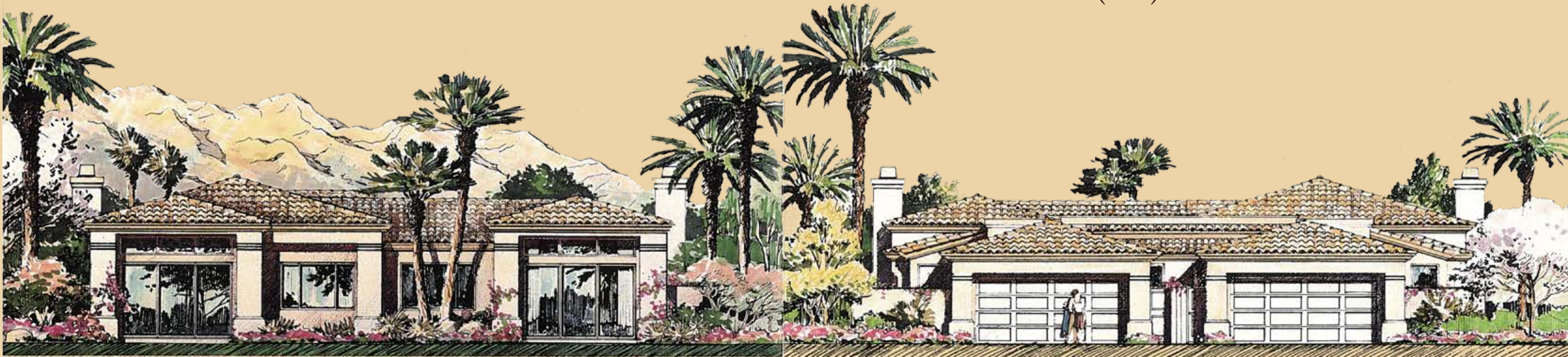
REAR "A" ELEVATION

Indian Ridge ON-SITE SALES (760) 772-7274