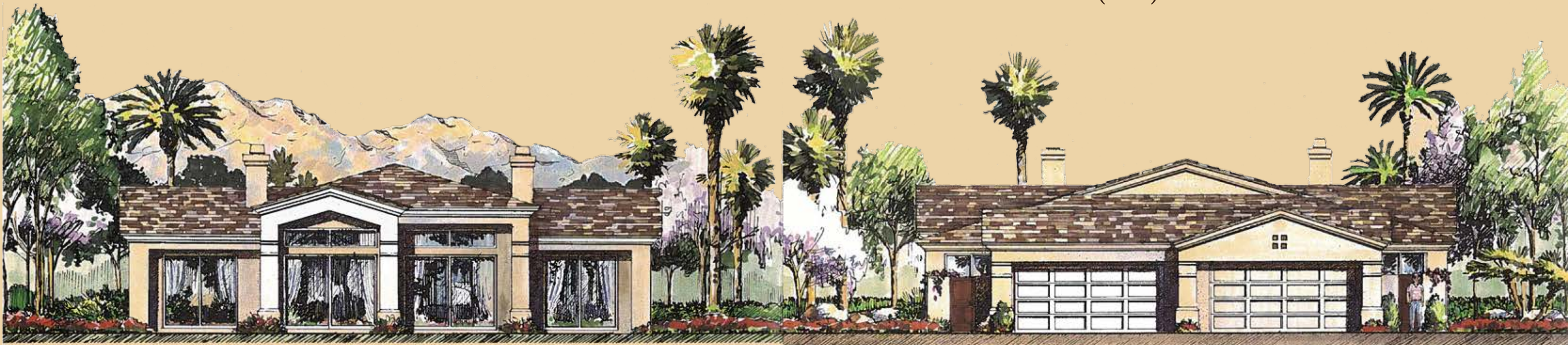
REAR "B" ELEVATION

Indian Ridge ON-SITE SALES (760) 772-7274