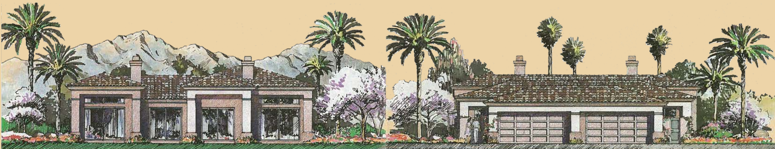
REAR "A" ELEVATION